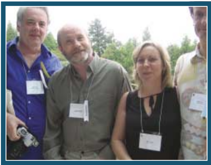
Some of the British delegates to the conference