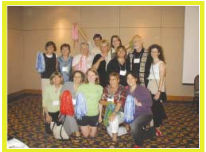
The number one reason for attending the conference was networking