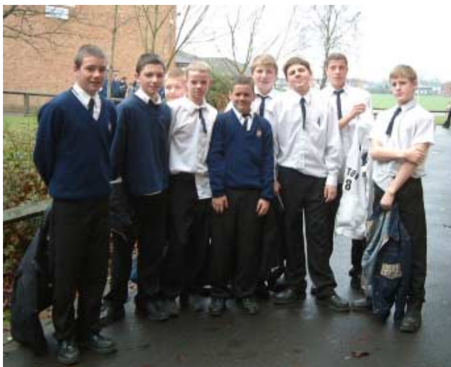
Some of the Year 10 pupils from Beaufort Community School, performing Fair Shares community work as part of their vocational curriculum and active citizenship