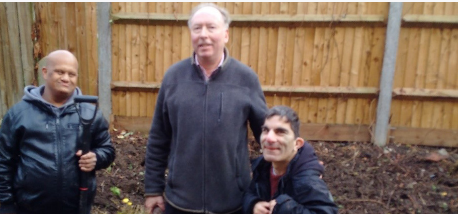
Your Choice Barnet service users and a member of staff after completing a gardening scheme

Working with an asset based approach the timebank enabled the service users to be engaged in a wide range of activities ranging from dog walking to helping run a session at the drop in. The time exchanges gave important opportunities to engage with the community and enabled the Timebank members to be seen assets. An example of this was the gardening project which had over 40 hours of gardening work in Barnet, raising the profile of YCB and enabling Barnet Homes residents to have their garden attended to. For most of the YCB service users this was the first time they had volunteered their time, thus proving that timebanking can be an excellent tool for those with physical or learning disabilities.