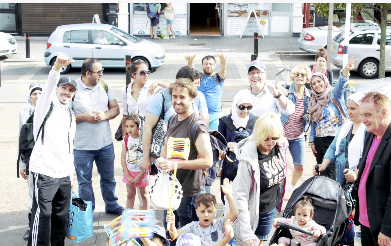
Timebank members and Syrian families enjoy a trip to Southend

To evaluate the Timebank a social value evaluation was carried out for years 2015 - 2017 using the HACT Value Insight Social Value Calculator. A total social value of £518,251 was achieved for 2015 – 2017 for the Time Bank. The Social Return on Investment, after taking into account the £55,479 project budget, was £462,772. Research validating this finding includes digital and paper surveys to the majority of Barnet Time Bank members.