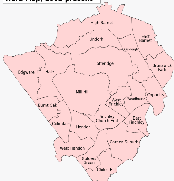
London Borough of Barnet Ward Map, 2002-present